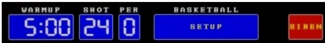
Figure 2: Status Bar