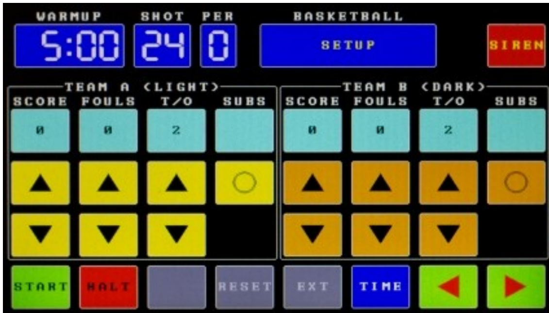
Figure 1: Main Operating Screen